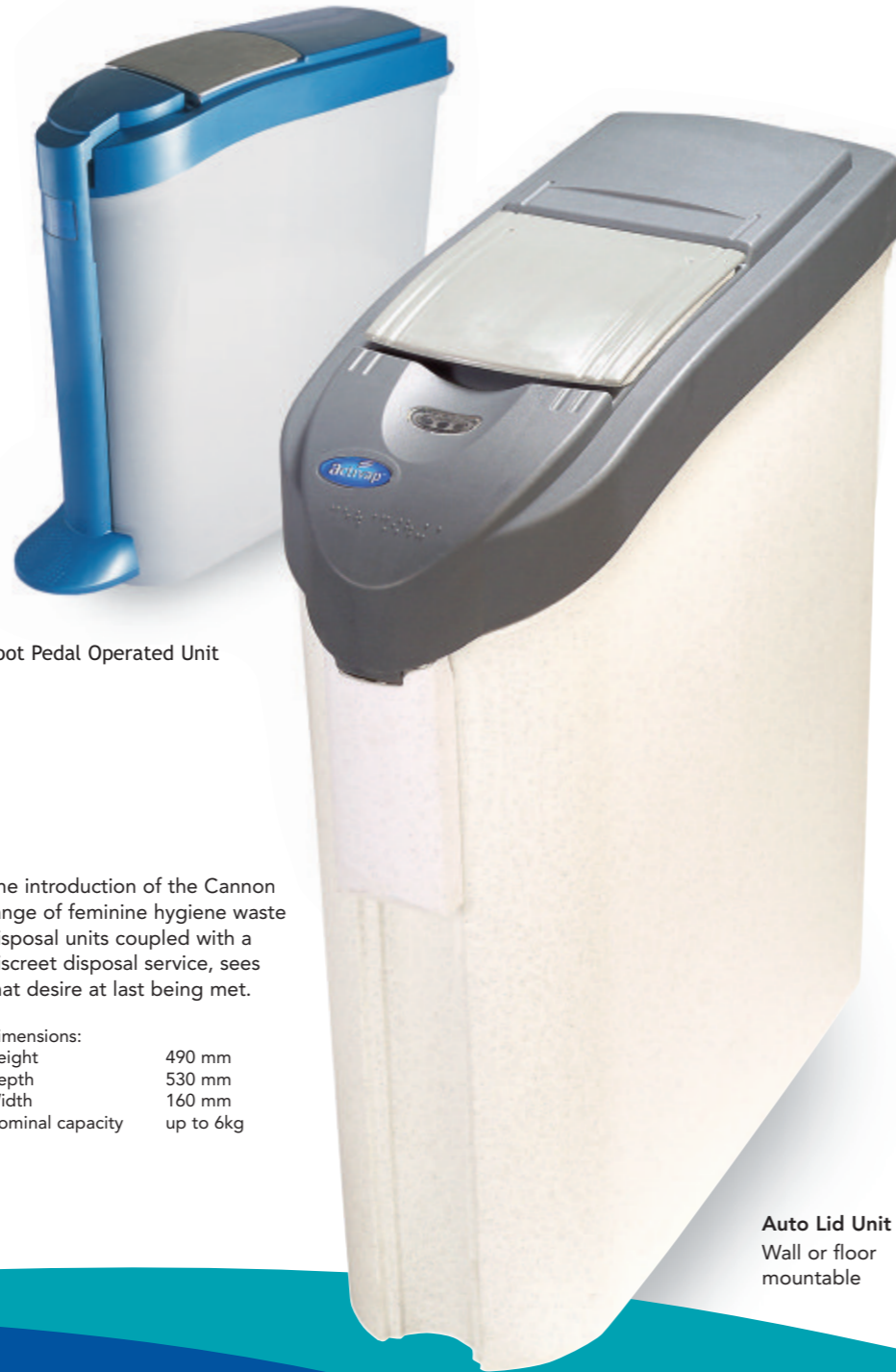
Foot Pedal Operated Unit